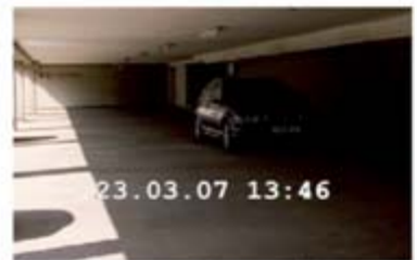
Scene without automatic image valuation