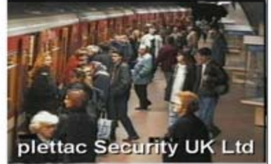
Image with text insertion

Individual text insertion in 2 lines with 20 characters per image.