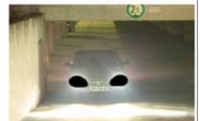
With peak light blanking

Heavy overdrive (e.g. in case of reflections) blanks out the related area and opens the iris (or SCS) a little more.