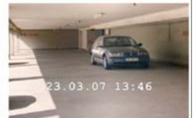
Scene with automatic image valuation

The integrated clock allows control of all features independent from time, date or third-party systems. Freewheeling or external synchronization with minute pulse.