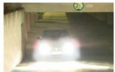
Without peak light blanking